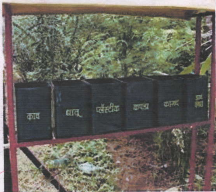
कचराची वर्गीकरी करायलाय करावी लागते