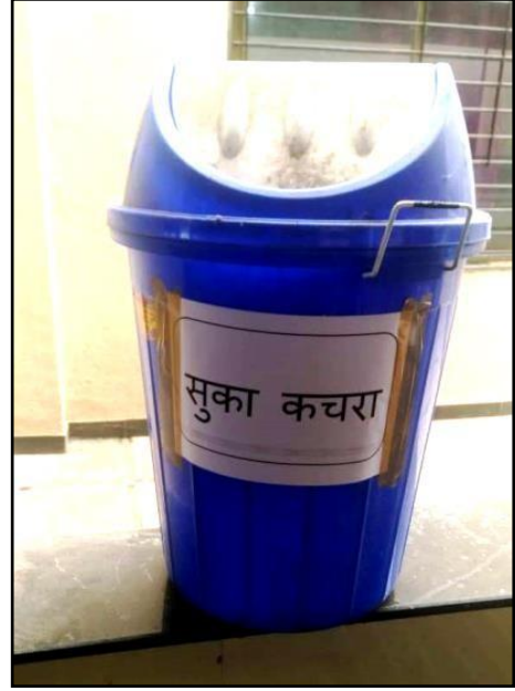
Dustbin in college campus