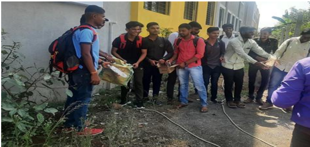
College students are collecting plastic bags and bottles in college campus area ( Ban on use of Plastic )