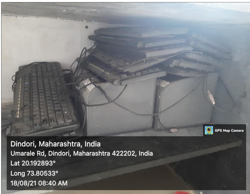
Computer ,keyboard, printer etc E-waste management