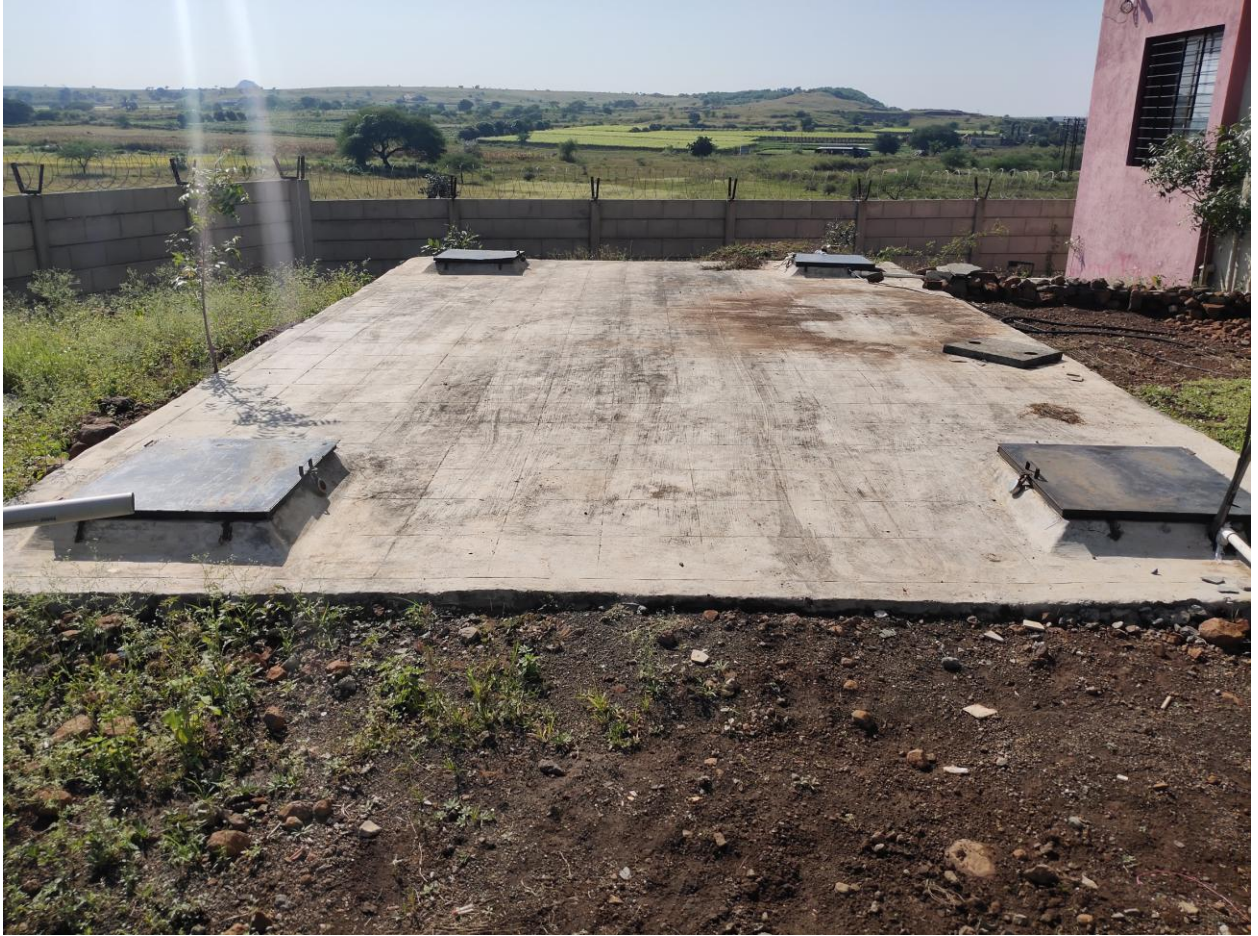
Construction of underwater tanks