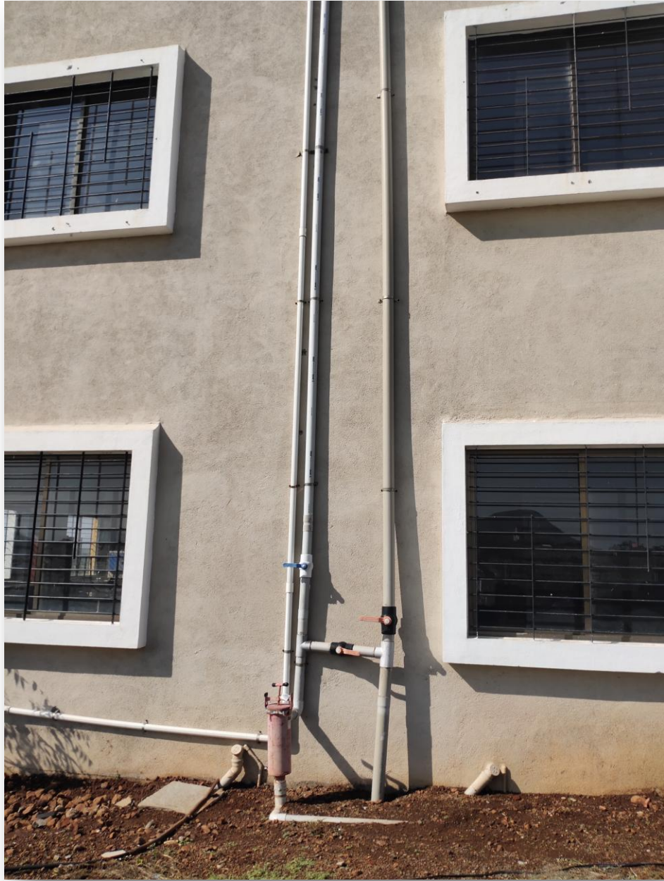
Rain water harvesting